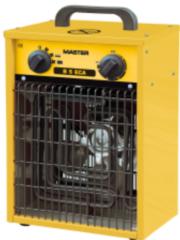
B 5 ECA