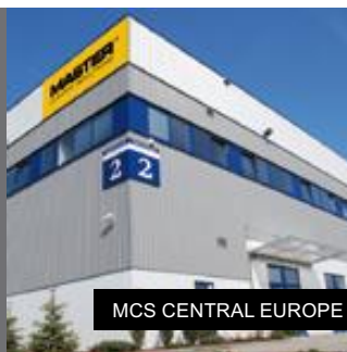
MCS CENTRAL EUROPE