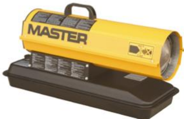
B 35 CEL